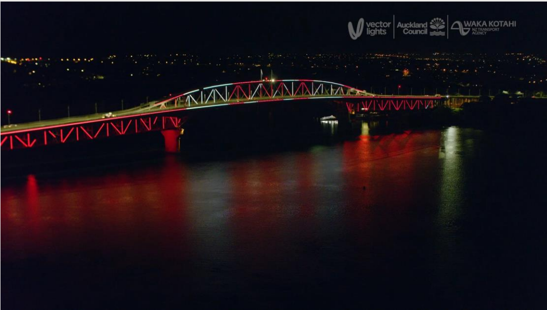
YouTube 15" Promotional Video